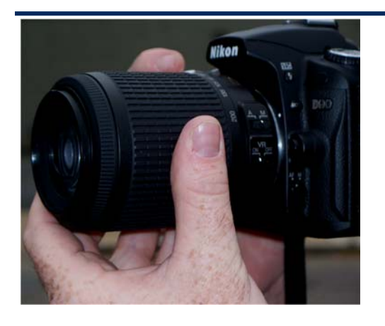
Our Investigators use state-of-the-art equipment.

Is this your employee or significant other?