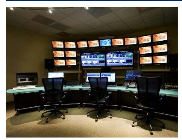
Security Command Center

IMPERIAL specializes in Distribution security. Distribution presents complex security tasks such as access control, employee screening, surveillance, and loss prevention. Wherever there is a concentration of valuable goods, criminals will try to infiltrate and exploit any security weaknesses. Let our IMPERIAL experts check for vulnerabilities in your security.