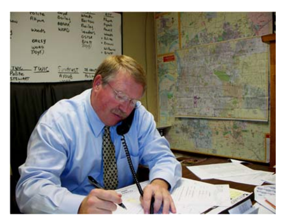
Site Surveys and client interviews are an integral part of the consulting process.