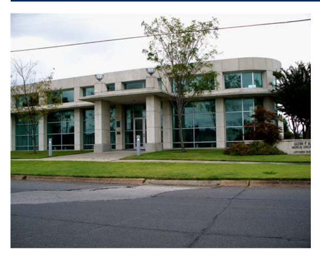
Office Security is vital to preserving Commerce.