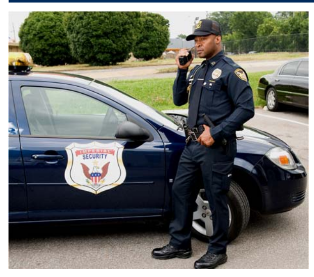
Patrol Vehicles and Mobile Field Supervi-